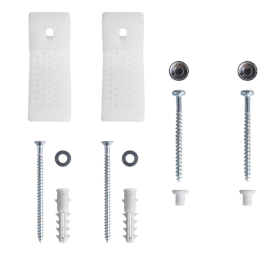
Floor Mounting Kit