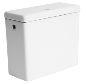
Water Tank (Fill Valve And Flapper Kit Pre-installed)